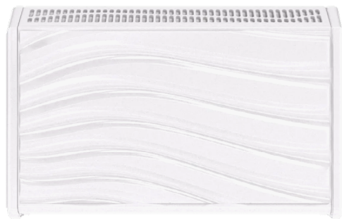
DRY WAVE 500