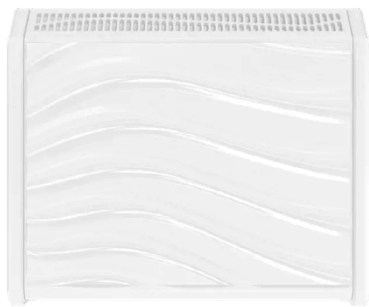
DRY WAVE 300 - 400

The DRY Wave product line is designed for indoor pools, wellness centers, and hot tubs. Its modern wave-shaped design not only enhances aesthetics but also ensures efficient dehumidification and heat recovery. The unit operates quietly, making it suitable for environments where noise levels are a concern. With multiple installation and control options, it offers flexibility to meet various user needs.