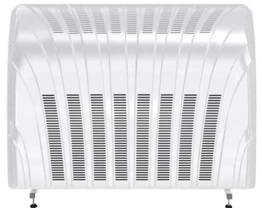
DRY WAVE 800 - 1200