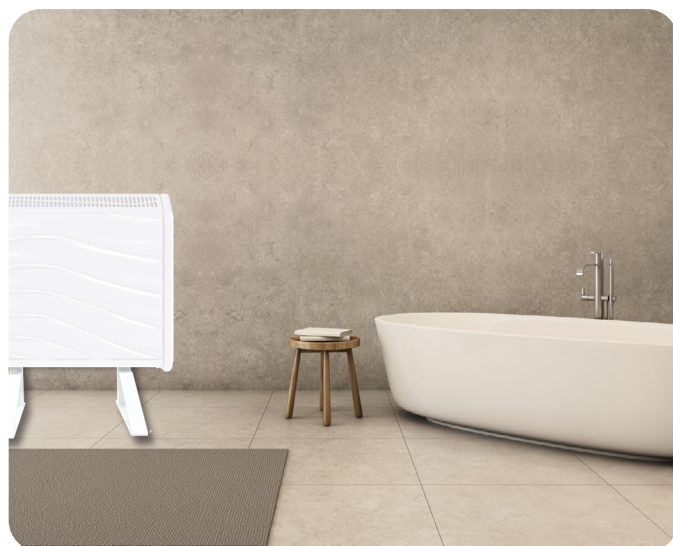
Fixed floor stand