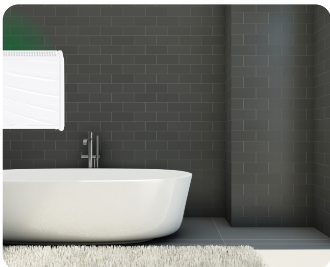
Standard: on the wall

Microwell offers customized, on-demand solutions tailored to your needs – at prices comparable to serial production. Choose from 25 base models and 50+ accessories to create a unit that fits your space and performance goals. Customize with over 200+ color options , various temperature ranges , installation types (wall-mounted, floor-standing, mobile, behind-the-wall, or ducted), extra heating (water or electric), fresh air intake, smart controls, and humidity visualization via microLIGHT+ . If others didn't have the solution – we just might. Request your tailor-made design today.