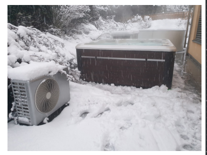
9.2 kW / 45 m<sup>3</sup>