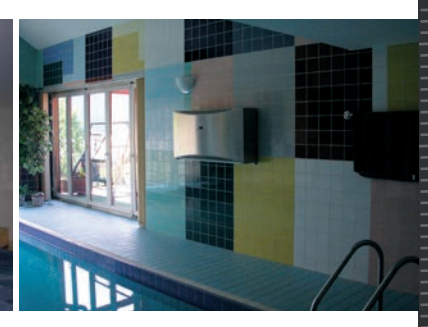
66 l / 60 m<sup>2</sup>