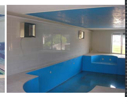
48 l / 45 m<sup>2</sup>