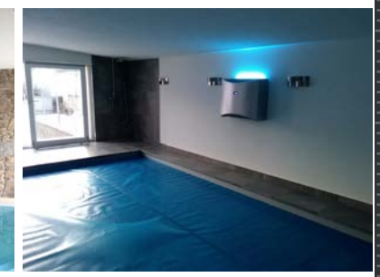
36 l / 30 m<sup>2</sup>